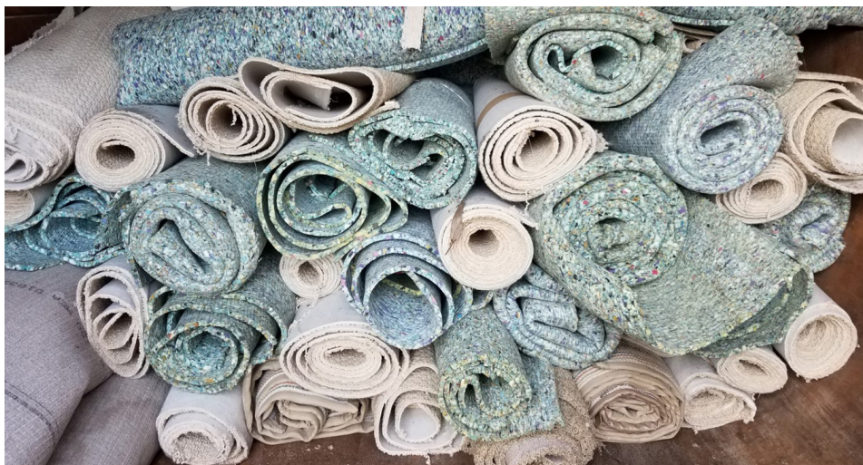
Caption: The Presidio Trust recycled 44 tons of carpet and carpet padding.

“It’s going to take a whole-of-government approach to build a more sustainable future, and the awardees announced today are leading the charge,” said EPA Administrator Michael S.